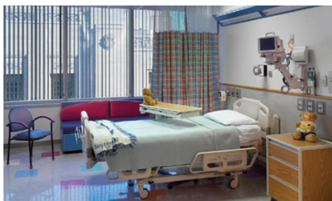
CHOP's commitment to use technology and processes that enable staff to respond to family needs effectively led it to select Ascom for its voice and messaging solution.

Overall, all users appreciate the effectiveness and reliability of their new Ascom d62 handsets. The d62s are functional and user-friendly which allows staff members to focus on their jobs at hand. The voice-capability of the handsets has proven to be a bonus over the 2-way pagers, allowing clinicians to communicate much more efficiently. Wireless phones have eliminated the need to page others and then wait by a fixed phone for a call back. Now, users call each other directly while they continue to provide care to patients.