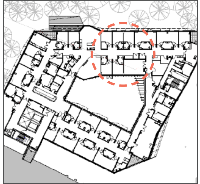
Ward Level Accuracy: Based on the basestation location The pop-up map when a duress event occurs in Ward 1