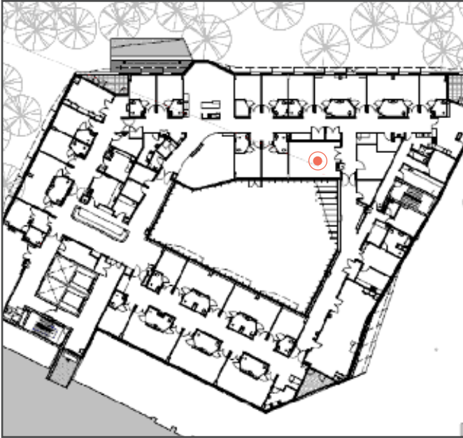
Room Level Accuracy: Based on RTLS technology The pop-up map when a duress event occurs in Room 6

When an alarm is raised, DURAlarm displays the device location and other alarm details with both textual and graphical components. We can deploy the location accuracy, depending on client requirements and satisfying a mixture of duress needs across the campus.