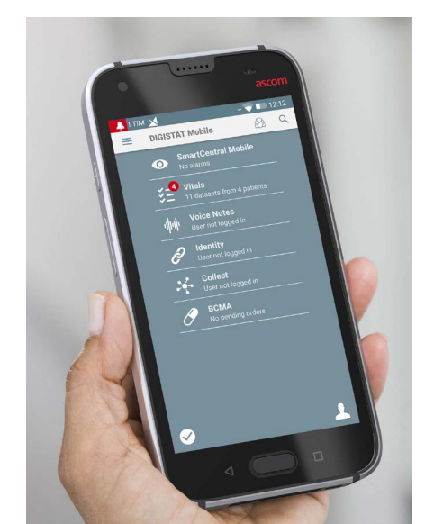
Giving caregivers the tools and data they need, wherever they are.

Digistat Mobile® is a suite of mobile apps for the full spectrum of care: ERs, general wards, ICUs, surgical and specialist units. Suitable for any acute care setting, Digistat Mobile helps ensure clinicians always have access to patient data, alerts, and assessment tools.