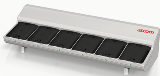
Battery Charging Rack Art. no. CR8-AAAA