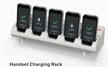
Handset Charging Rack Art. no. CR7-AAAA