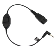
Headset adapter with QD 3.5 mm Art. no. 660515