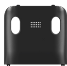
Cover rear, no clip Art. no. 660580