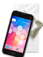
Screen Protector Kit Art. no. 660589 (Excl. Ascom Myco 3)

Not all the accessories listed may be available in your country or region. For further information contact your nearest Ascom representative.