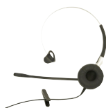
Headset "mic on boom" with QD, BIZ 2400 II Art. no. 660508