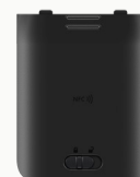
Battery Pack Art. no. 660578