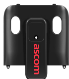
Cover rear, with clip Art. no. 660585