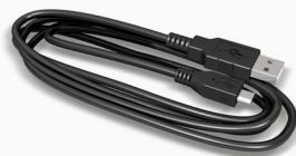
Micro USB cable Art. no. 660586