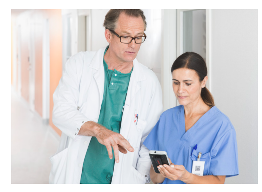
Communicate and coordinate effectively. Requests, messages and tasks go directly to assigned recipients.