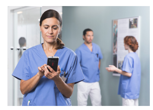
Lets clinicians access and share lab results, images, requests and alerts while on the go.