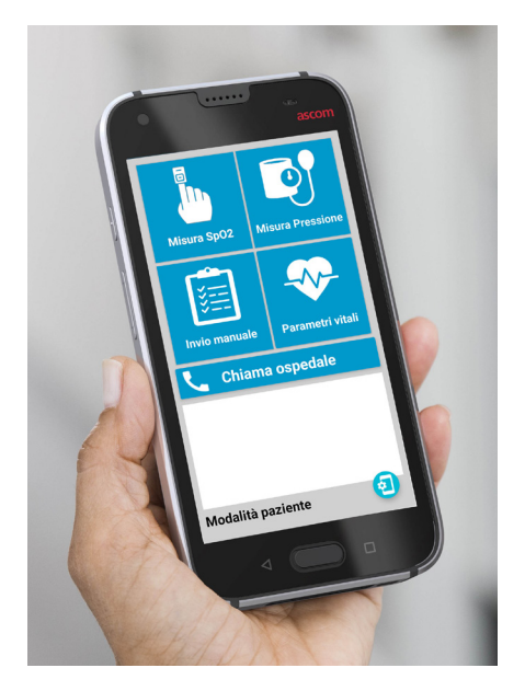
Easy to use patient facing applications and user friendly interfaces.

"We have discovered that people are flexible in a crisis; that innovation is possible in a short time, and that nurses have discovered the potential of technology."