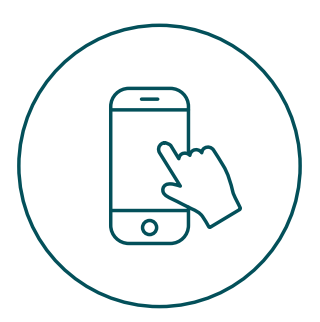
Response teams management